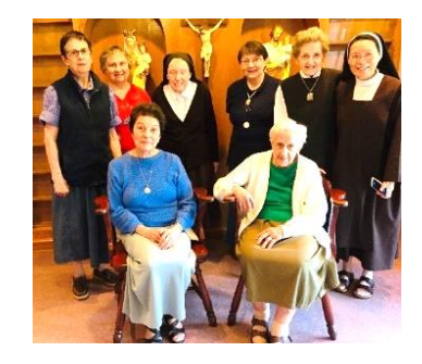
Sisterly Visit in Concord, 2019

And best of all, these visits have been an in-person expression of sisterly solidarity and unity that well serves the building up of Carmelite life in this country. Moreover, they have laid the groundwork of trust that will enable us to explore moving forward in accomplishing this goal using Zoom technology in the future.