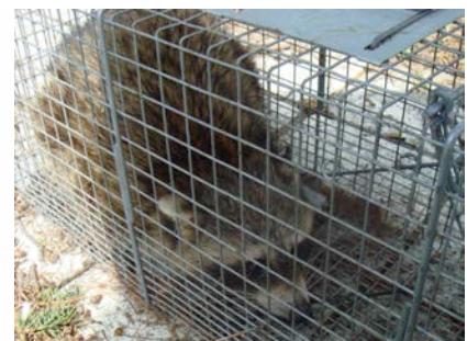
Rocky waiting for the country bus