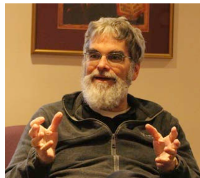
Br. Guy Consolmagno, SJ

March saw us welcoming many guests. We were joined by the confirmation classes from Our Lady of Hope and St. Luke’s parishes for a Saturday afternoon program followed by Vespers in our chapel. At the end of Vespers, the young people were invited to ask questions of us which resulted in a wonderful and lively discussion. We welcomed Brother Guy Consolmagno, SJ, the Vatican Astronomer, to share some of his science with us as a means of ongoing formation. The Vatican observatory is now located in Tucson, Arizona because the night sky is still quite dark there. We were fascinated with his work and his discussion of the phenomenon of vast space. An unexpected guest was Sr. Helen Prejean who we were honored to meet when she while she was visiting the area to attend the opening of the opera, “Dead Man Walking” at the Kennedy Center. She is a close friend of 2 members of our congregation. Sr. Helen shared with us many stories of her past and present as she continues to raise people’s consciousness of the unfairness of our prison system and promote the end of the death penalty.