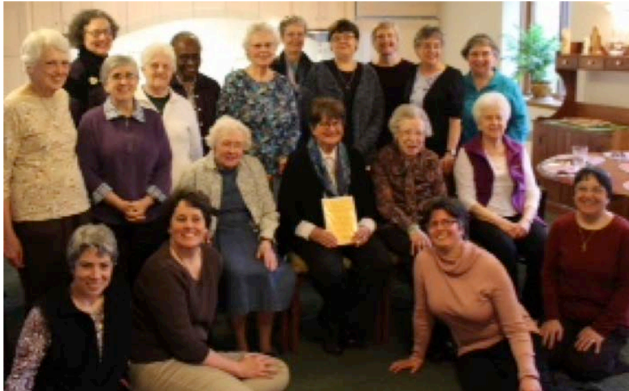
Sr. Helen Prejean (center) with community