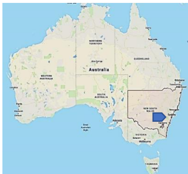
Varroville is a suburb of Sydney

Long before it was fashionable to reach out across international borders (at least in the case of Carmelite communities) the CCA was issuing invitations to representatives of other Associations and Federations around the world to attend their Assemblies as observers. I remember the first invitation we received caused something of a stir. Our Association of Our Lady of the Southern Cross has member-Monasteries in Australia, New Zealand, Samoa, Wallis-Futuna, and Hong Kong. ‘How could we possibly attend’ we thought! It was like asking us to go the moon; it seemed so impossible. But thankfully the CCA persisted, and eventually we were able to attend an Assembly, and it changed everything for us.