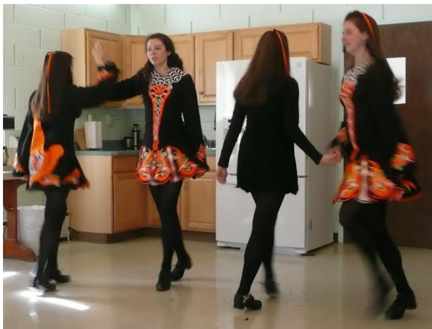
Some Irish step dancers entertained us for St Patrick's Day