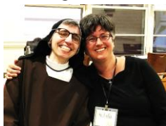
Sisters enjoying seeing each other again

We gathered at the Jesuit Retreat House in Faulkner, Maryland, from across the United States, and as far away as Scotland and Mexico. From the moment we arrived, the energy was palpable — the opportunity to see old friends and the wonderful chance to meet other sisters who are new to Carmel, new to their association, and new to knowing each other.