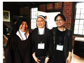
Touring the original monastery at Port Tobacco, Maryland