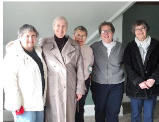
Sisterly Visit in Cleveland's "new" monastery, 2019

"We have continued to provide active, mutual support to the identified needs of our communities, in particular, sisterly visits of each member community by the Leadership Team or delegates in the next term. "