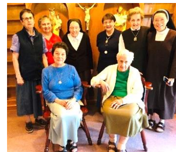
Sisterly Visit in Concord, 2019

And best of all, these visits have been an in-person expression of sisterly solidarity and unity that well serves the building up of Carmelite life in this country. Moreover, they have laid the groundwork of trust that will enable us to explore moving forward in accomplishing this goal using Zoom technology in the future.