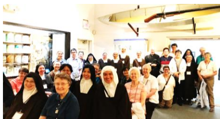
Visiting St. Mary's City museum